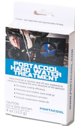
HARD WATER TREATMENT