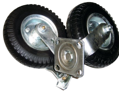
ALL TERRAIN CASTERS